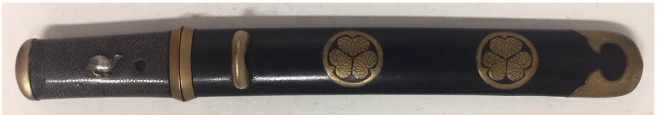
Figure 5 – Koshirae for subject sword

The subject sword came in a koshirae of dubious origin. (See figure 5 below) It is an aikuchi style with Tokugawa family Mon painted on it.