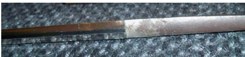
Figure 4 - Yoroidoshi signed Yoshiteru and dated 1865 (NMB Website discussion)

However, we found on the internet several examples of this kind of yoroidoshi made at the end of the Tokugawa period. In a post by SAI-JO-SAKU on the Nihonto Message Board (NMB)( http://www.militaria.co.za/nmb/topic/5205-yoroi-doshi-tanto/ ) he discusses a yoroidoshi signed Yoshiteru and dated 1865. It has a very thick kasane of 12.7mm (see figure 5 below) In the course of discussion many other Shinshinto yoroidoshi are displayed and discussed and it is clear that these types of Shinshinto tanto are not unusual.