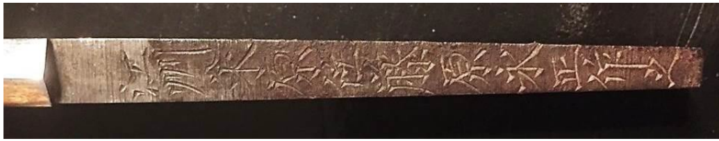
Figure 2 the signature on the mune, which is not usual