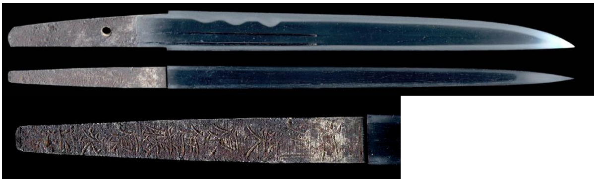
Figure 3- Nagamasa Blade on Tokugawa Arts Website

The signature, shape and workmanship of the two swords are almost identical. It is therefore possible to conclude (as mentioned above) that the sword was made by a relatively unknown sword smith, working in the turbulent period just before and after the Meiji Restoration.